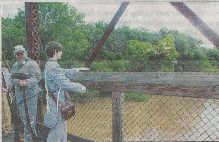
A wreath is tossed into the Staunton River during the 152nd anniversary commemoration of the Battle of Staunton River Bridge Saturday morning.