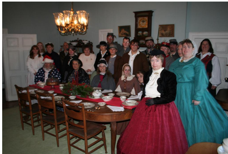
Figure4: Volunteers gather together for a photo following the Antebellum Christmas Open House at historic Mulberry Hill Plantation in Randolph, Virginia.

An Antebellum period Christmas was celebrated at historic Mulberry Hill Plantation. The ancestral home of Judge Paul Carrington and the grounds were open to ring in the holiday season. Re-enactors provided living history demonstrations and campfire cooking in the boxwood gardens. A historic tour of the main house and its dependencies was given by period-dressed docents. Ole St. Nick was on hand to wish one and all a Merry Christmas. Light refreshments were served. Approximately, 50 people were in attendance.