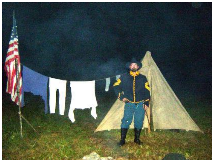
Figure 3: General Kautz of the US Wilson-Kautz raid manifested himself during the Haunted Harvest Hayride, where more than 305 people attended and volunteer staff numbering more than 50 logged more than 898 volunteer hours.

In total, 305 enjoyed the seasonal event and total of 898 combined volunteer hours were logged.