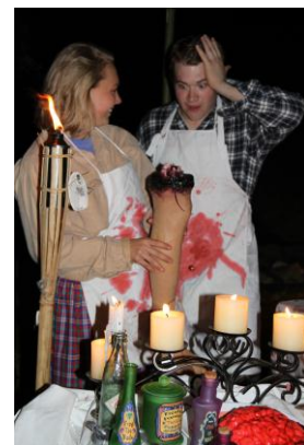
Figure 7: Children enjoy the pirate-themed Halloween Party (left); Scary Clowns pose for a photo during the Haunted Trail (center); and Haunted Hayride Volunteers showcase a medical tent from Mrs. McPhail’s Tails.